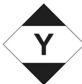
1. Standard DGLQ Label Road and Maritime.